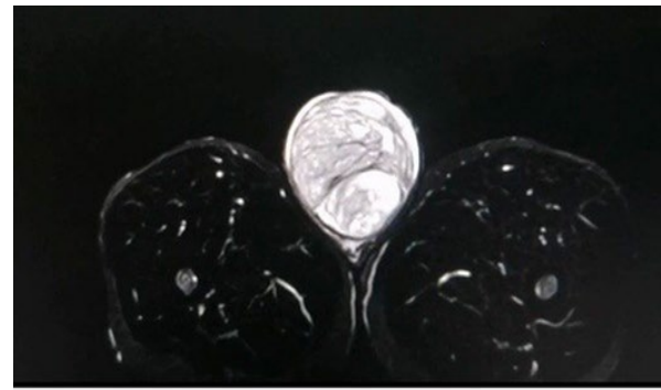
Figure 2: Axial T2 STIR MRI image showing a well-defined mass confined to the scrotum occupying the midline due to its large size, showing internal hyperintense thin septations in relation to the abnormal highlighted testicular surrounding tissue corresponding to histopathological reported fibrous septations.